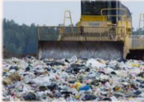
Waste treatment plant ▲