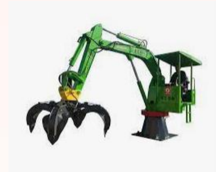
Hydraulic machinery ▲