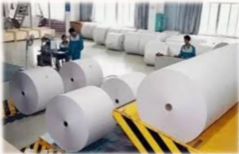
paper making ▲