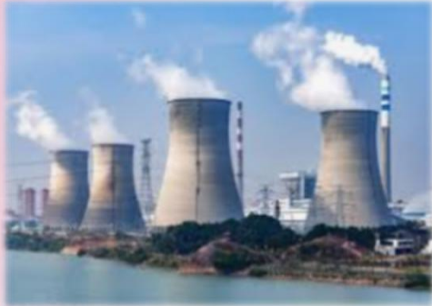
power plant ▲