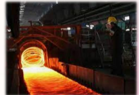
steel rolling ▲